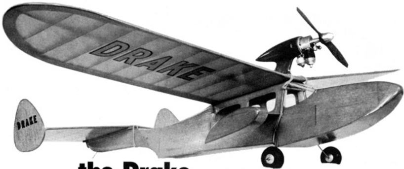
the Drake...