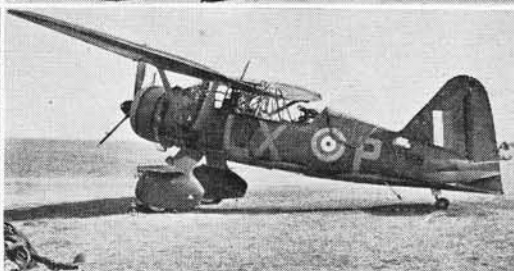
Partisan version is all black under, 1942 type roundels, has large cylindrical canister under fuselage, seen in N. Italy. LX-P shows yet another fin flash style and roundel size for 54 O.T.U.