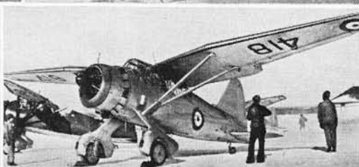
Revised fin flash and no wheel covers on O.T.U. version at left, Yellow under, Green/Earth top. All silver Canadian trainer, has numbers and roundels under wings