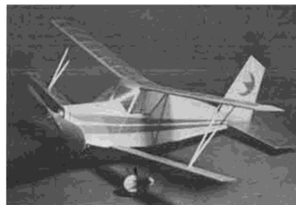
Without drag flaps for tight turns in flight, the Nieuport-Beech will really take off!

The tail surfaces are one-sixteenths of an inch thick and are built directly over the plan. When they are dry, remove them from the plan and sand the leading and trailing edges half round. Cover both sides of the tail surfaces with Japanese tissue.