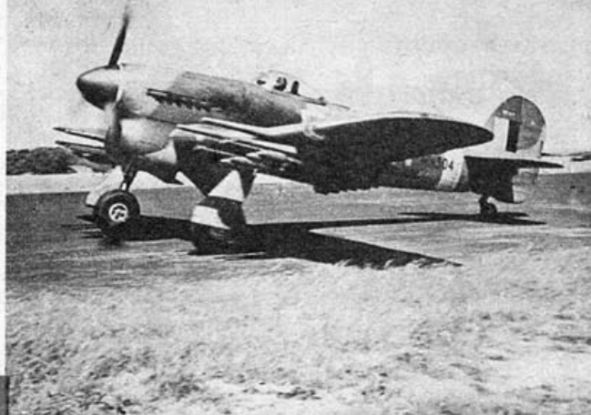
Deadly rocket firing Typhoon taking off on June 6, 1944 for raid on enemy radio installations near Boulogne, France.

Our Typhoon can take most engines from .14 to .29 cu. in. displacement. Powered with a .29 engine, the prototype model stepped along at a lively pace although not uncomfortably fast. With approximately 128 sq. in. of wing area and a fully enclosed engine, there is no reason why this Typhoon replica could not be entered in team racing competition. Building instructions are on the full size plans.