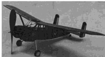
The Broussard MH1521 may not be a good duration model, but it is beautiful!

The model presented here is an attempt to capture the same flavor that