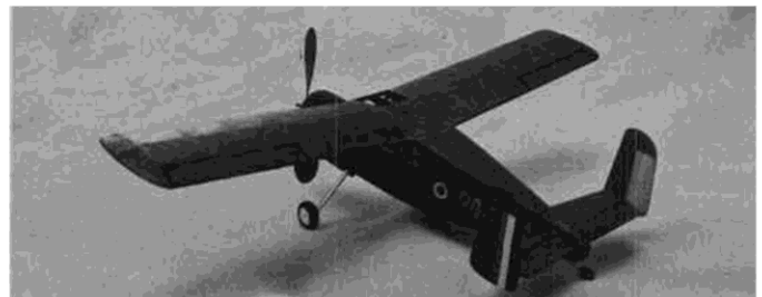
Build this model with lots of downthrust because of the relative small size of the horizontal stabilizer.